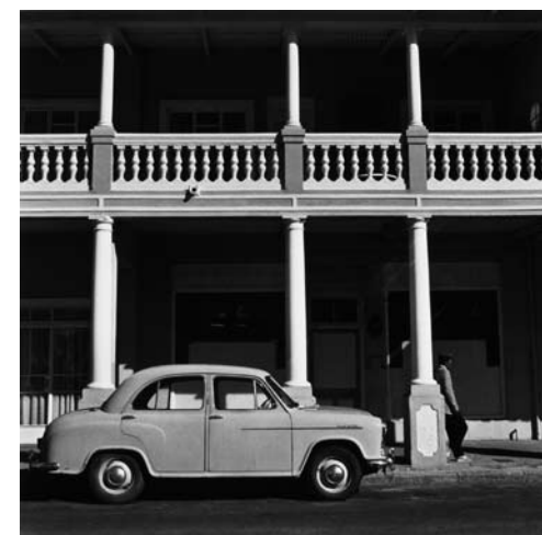
Roger Ballen , Oblivious , 2003 / Roger Ballen , Indonesia , 1979 / Roger Ballen , Side view of hotel, Middleburg , 1983.