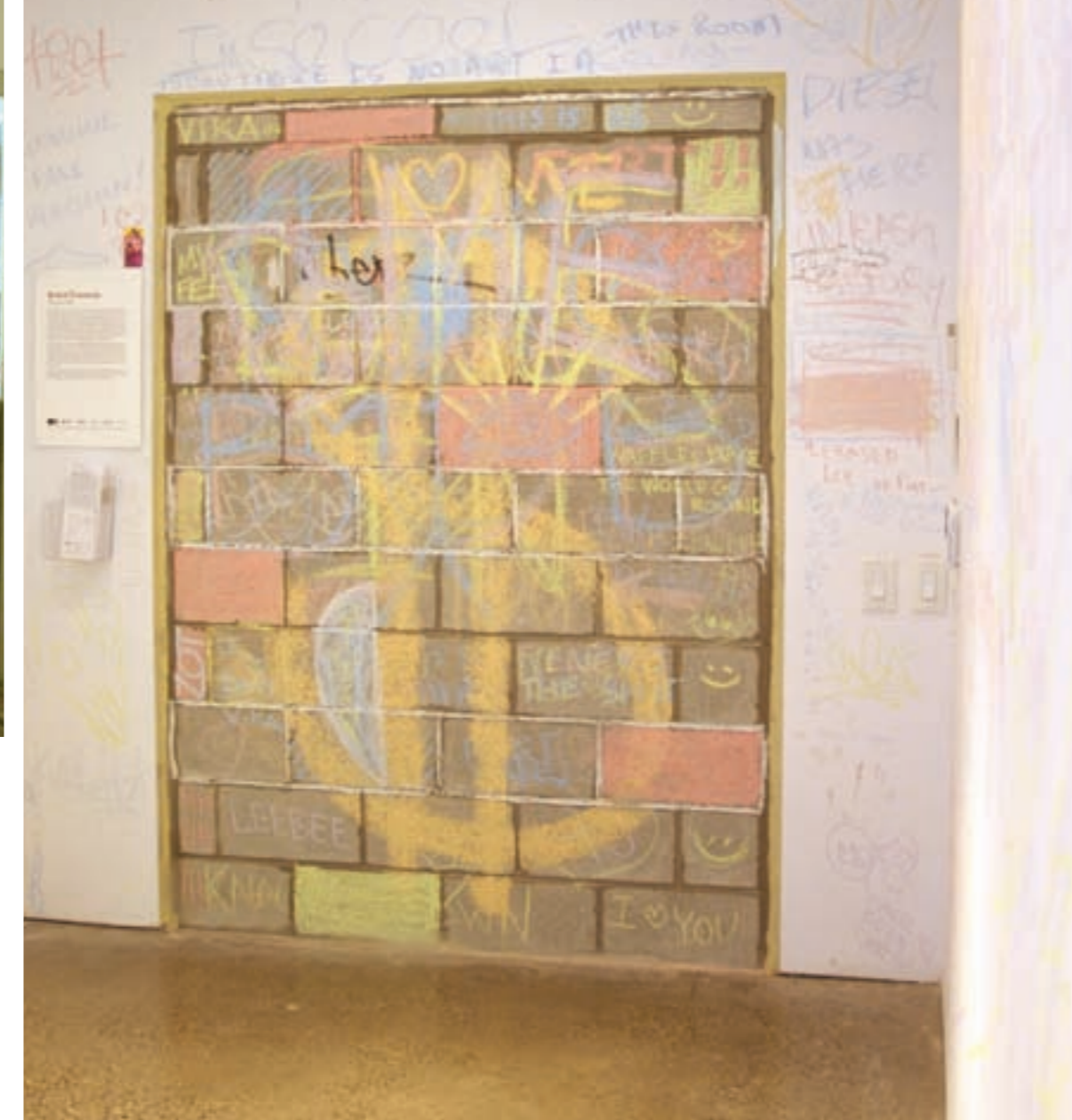
LEFT: VIEW FROM INSIDE THE PROFESSIONAL GALLERY AS THE INSTALLATION IS BUILT