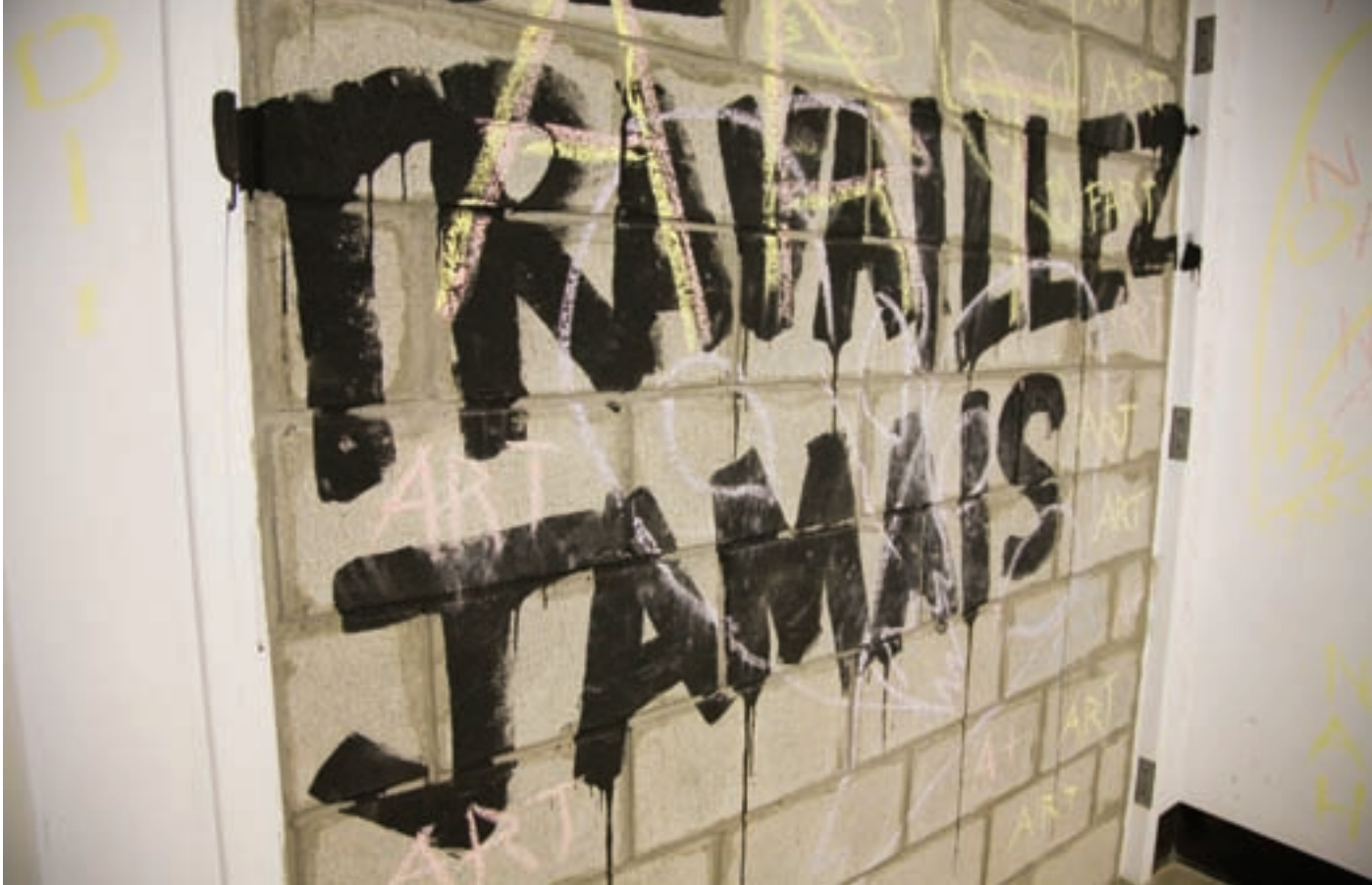
ABOVE: RIRKRIT TIRAVANIJA UNTITLED INSTALLATION AT THE OCAD PROFESSIONAL GALLERY, 2007