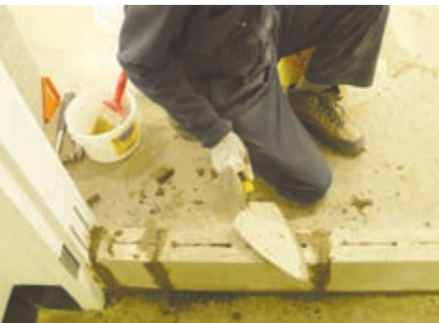
LEFT: CONSTRUCTION OF THE INSTALLATION