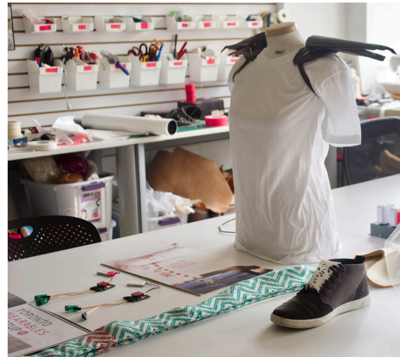
A display of wearable technologies from the Social Body Lab socialbodylab.com

forms, and creative practice. Faculty members embrace both traditional forms and fabrication practices while also engaging with digitally-enabled art and design practices, processes, and products. The studio environment provides a space of creation that becomes a site of critical inquiry, where the relationships between the makers and forms themselves enable new knowledge to emerge, and offer a chance to implicate communities and cultural contexts. Distinct from and building on anthropological or archaeological studies of material, research under this theme engages materials and forms in relation to creative concepts, aesthetics, embodied actions, and the social, historical and political implications of mediums.