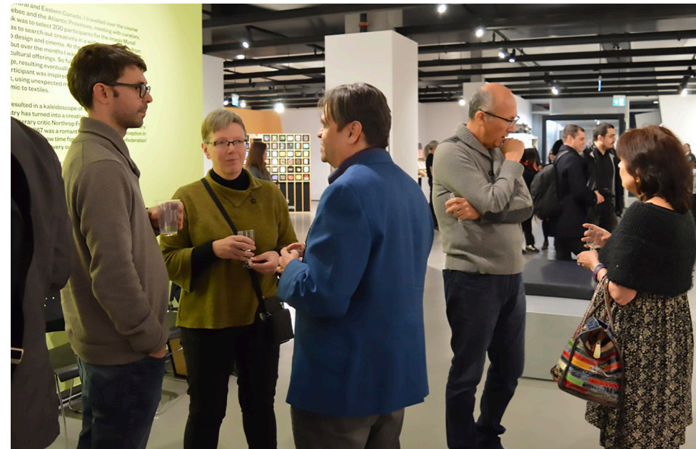
OCAD University's Celebration of Research 2018.

This Strategic Research Plan will track this progress year over year, including the continual refinement of research and its many impacts. Our approach is sensitive to the context in which we live and work, and is flexible and sensitive to the uniqueness of OCAD University research, allowing for changes in direction and context.