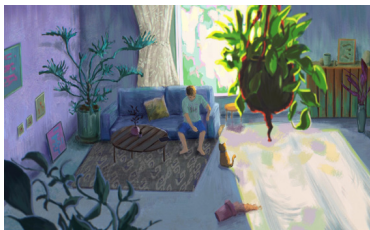
Leon Chen, A Day in Summer, digital illustration, 2020

Allowing and encouraging artists to look beyond the grim reality of identity politics and political discourse, this exhibition aims to bring together works of art that are centered around ideas